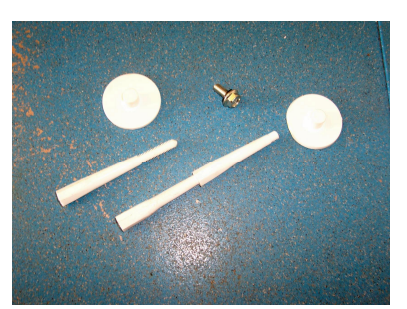
Standard 5/16" bolt